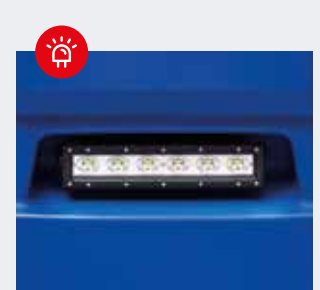
FRONT LED LAMP For optimum visibility (and thus safety) during operation