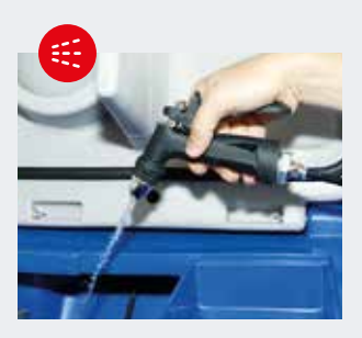
SPRAY GUN For cleaning the recovery tank, for example